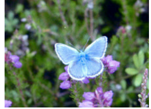
Silver Studded Blue Butterfly

Bracken clearance and the encouragement of new Bell Heather growth by the Commons Group has benefited this Biodiversity Action Plan for conservation of this species of butterfly - bare patches of heath has also encouraged the spread of Black Ants with which this species has a symbiotic relationship. Richard Havard