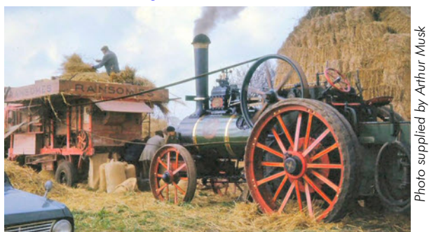
Steam Threshing on Bartholomews Farm in Bartholomews Lane.

Log on to the new website address www.wenhastonarchive.org.uk to see for yourself.