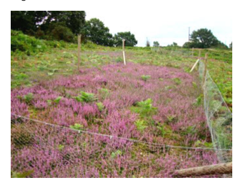
Rabbit exclosure on Blackheath showing growth of heather.

Many of you will have noticed the fenced exclosures that have been erected in the past 18 months on the commons that surround the village.