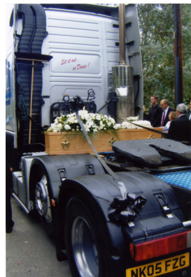
Final Journey