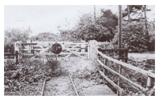
A later photo of the Railway Crossing. This photograph was taken in the 1930s as the track became overgrown.