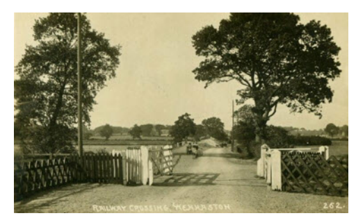
View of the Railway Crossing. This image is available as a card - one of the Wenhaston Archive Notelets (sold in packs of 8). See website above.