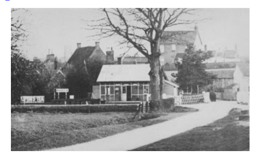
From a postcard showing Wenhaston Station. This image is available as a card - one of the Wenhaston Archive Notelets.