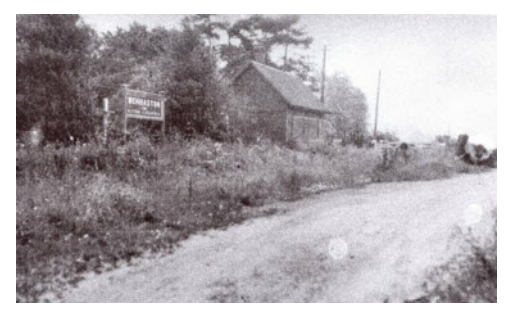
Wenhaston Station in the 1930s after the railway closed in 1929.