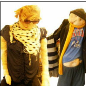
Life-sized spectator sculptures