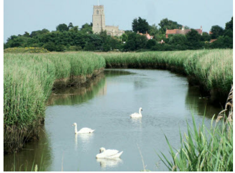
Swans on the River Blyth (easy to spot!)

September 14th 2009 with new house keys in hand, I raced to the first floor sitting room to take in the spectacular views of the Blyth Valley before the very able and enormously hard working Philip Peck and his team arrived with our worldly goods. Me being Nerdy me, I spent a minute or two looking for my first 'tick' for a new list of birds seen from the garden or house. What would it be? Not the Blue Tit, Chaffinch, Collared Dove or ubiquitous Robin as you would fully expect - no, but a pure white Little Egret drifting high over the garden then slowly gliding down to the meadows beyond the line of trees which, I eventually discovered, forms a border with the former Southwold Railway track-bed. What a cracking start to what has become a fabulous first year's bird watching around the village.