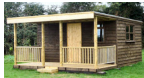
Sports Club Pavilion

discounts from Ridgeons. All agreed that the Sports Day was a success with many club members, guests, and young people enjoying the tennis, BMX, BBQ, games, and other activities. We hope to build on the success with next year's event.