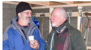
Socialising in the WALGA shed