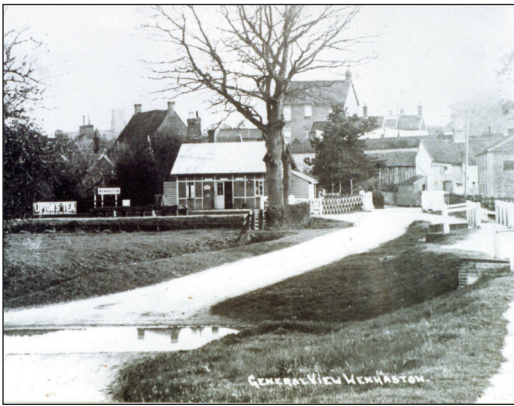
Wenhaston Station with The Run in foreground