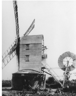
Kitty Mill, Wenhaston (off Back Road)

There has been a wonderfully enthusiastic response to the requests for old Wenhaston photographs and memorabilia. A small but dedicated group have been busy scanning all these documents and photos into a database. This enables the original item to be safely returned, while the database means images can be stored and looked at in detail. Eventually a website will be created enabling greater access to these precious records of Wenhaston life, which otherwise may not have been seen by many people, or may have been lost altogether.