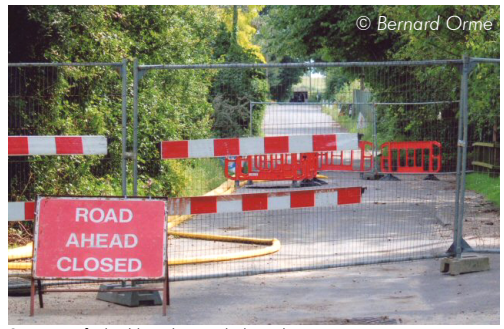
Section of Blackheath Road closed