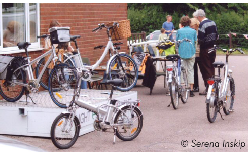
Electric bicycles at the Energy Day