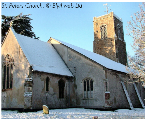
See a photo panorama from the top of the Church tower on <a href="https://www.wenhaston.ws/panorama/index.php">www.wenhaston.ws/panorama/index.php</a>