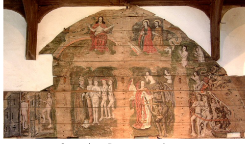
See the Doom on-line at www.wenhaston.ws/doom/index.php